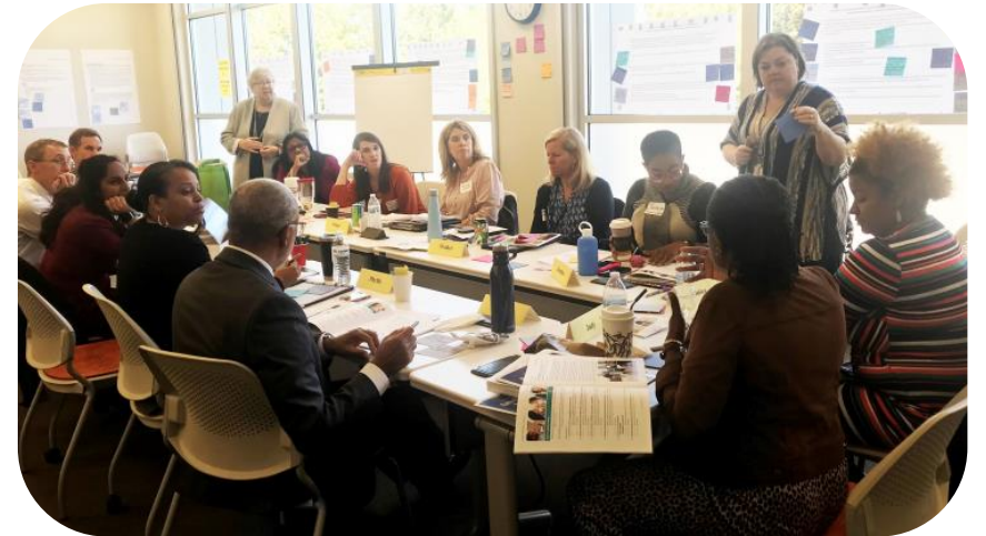
NCDHHS Cross-Divisional Fall Workshops on Early Childhood Action Plan Goals