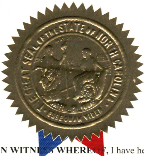
Roy Cooper Governor

NOW, THEREFORE , I, ROY COOPER, 75th Governor of the great State of North Carolina, do hereby proclaim Pinehurst “THE HOME OF AMERICAN GOLF.”