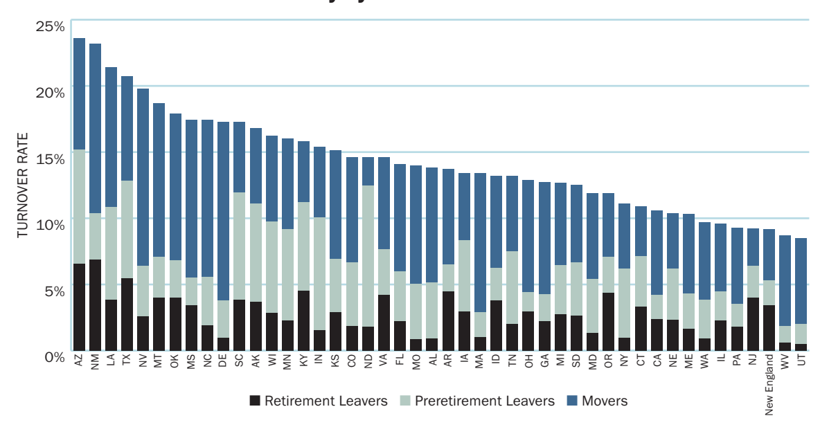
Figure 1 Teacher Turnover Varies Widely by State

Note: States with fewer than 25 teachers surveyed were excluded (DC, HI, and WY). Three small New England states with similar data patterns were combined (NH, RI, VT).