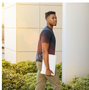
College students considering a different major or career path