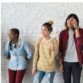
Middle school students exploring their career options